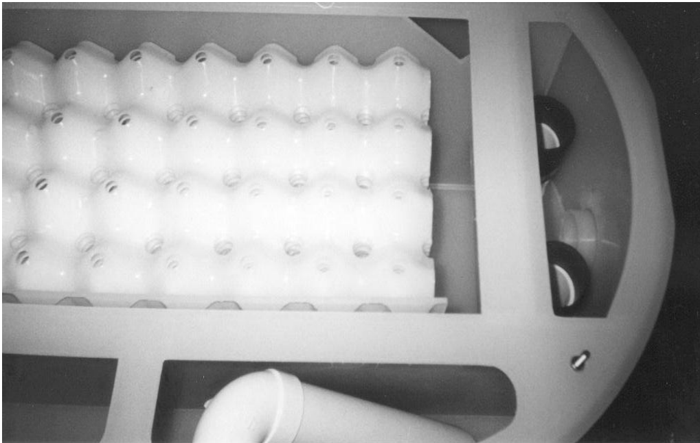
MSR 11 view showing inlet distributor and seals with oil overflow v-weir