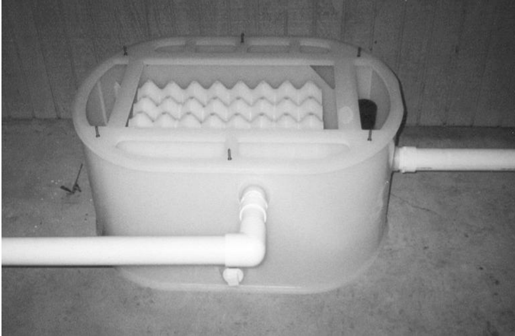
MSR 11 separator, typical industrial installation, Inlet from left, outlet on right. Plug shown at bottom is drain (oil out same position, far side).