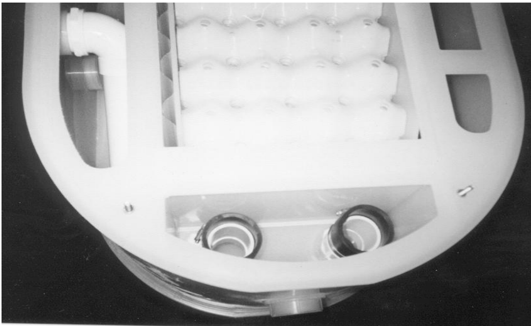
MSR 11 view showing water overflow weirs and outlet connection. Inlet distributor is shown at left. In this view the plate seals can be seen as well as the collected oil reservoir.